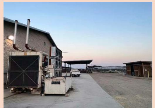
Left: Beautiful Sunset at the Ansonea Dairy; Top: Now Empty Outbuildings at the Ansonea Dairy