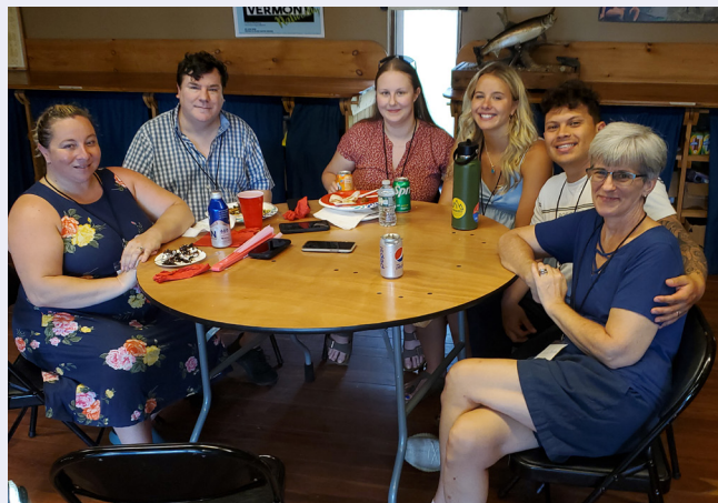
TABLE NO. 4