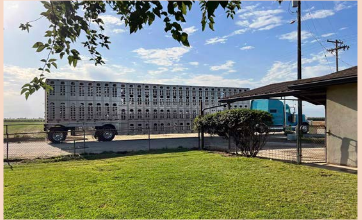
Cow Trucks Arriving and Departing From the Dairy